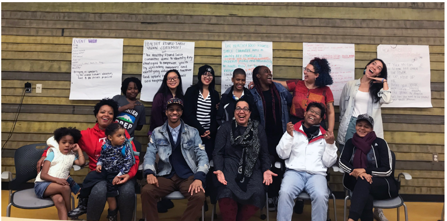
Above: 2018 Healthy Food Round Table Committee

Through our research, the Committee found that availability and affordability are the two most significant barriers for young people to eat healthy outside of school. Fresh food is too far away, inaccessible by bus, and too expensive. The majority of inexpensive options for young people in White Center are fast food, not fresh or nutritious options.